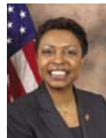
Rep. Yvette Clarke chairwoman, Homeland Security Committee, U.S. Congress (tentative)